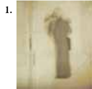
no. 1, 2010 Digital Photograph 14"x16.5" large print 5"x7" small print

each 495 — all four 1500 — " 125 — " 400 —