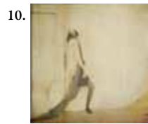
no. 2, 2009 Digital Photograph 16"x16" print 24"x24" framed $595-