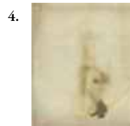
no. 4, 2010 Digital Photograph 14"x16.5" large print 5"x7" small print