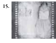
no. 4, 2010 Digital Photograph 16"x14" framed $575-