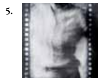
Seams, 2010 Digital Photograph 16.5"x14" framed $575-