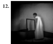
no. 3, 2009 Digital Photograph 16"x16" print 24"x24" framed $595-