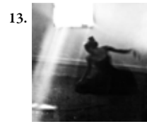
no. 5, 2009 Digital Photograph 16"x16" print 24"x24" framed $595-