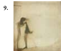
no. 11, 2009 Digital Photograph 16"x16" print 24"x24" framed $595-