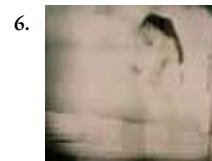
Fabric, 2010 Digital Photograph 20"x18" print $575-