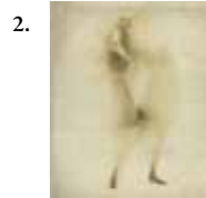
no. 2, 2010 Digital Photograph 14"x16.5" large print 5"x7" small print