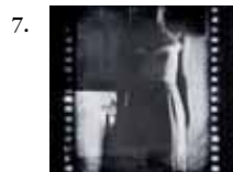
Four Conversations, 2010 Digital Photograph 16.5"x14" framed $575-