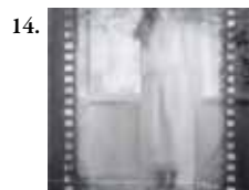
no. 2, 2010 Digital Photograph 16"x14" framed $575-